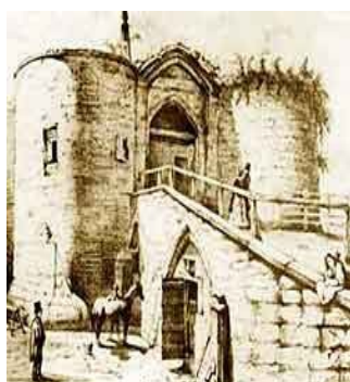
The iconic Nottingham Castle Gateway

Bank holiday Monday 6 May 2013 The Museum of Nottingham Life at Brewhouse Yard, Castle Boulevard Nottingham NG7 1FB see mynottingham.gov.uk/kneesup or telephone 0115 9153700