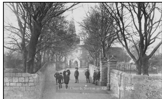
St. Mary's Church Sutton c. 1932

Visitors are most welcome. See www.suttonheritage.org.uk/ for more information.