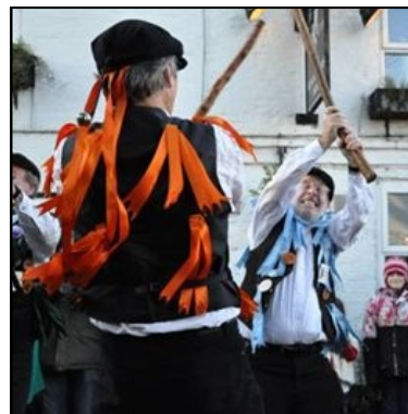
Last Years festivities

Rattlejag Morris, the colourful and only traditional dance side preserving the dance and music traditions of Nottinghamshire and Lincolnshire, will be out on their annual Boxing Day Tour in the north of the county on Thursday 26th December, whatever the weather. At noon they will be dancing outside the Blue Bell Inn , High Street, Gringley-on-the-Hill, DN10 4RF (followed by a live music session in the pub by the AVID group), after which the team move on to perform at the Blacksmith's Arms , Everton, DN10 5BQ and then host a traditional music session in the pub afterwards. Come and take part in a living Christmas-tide tradition - you may even get a chance to dance too! - at these lovely old pubs where the welcome, food and drink are also excellent.