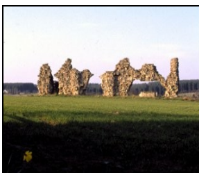
King John's Palace