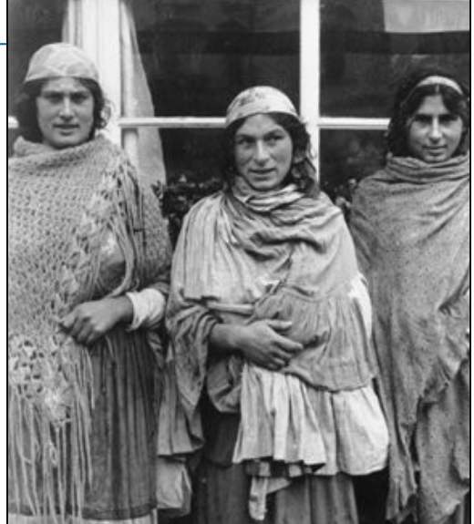
Three Sinti and Roma women, Warsaw

Further details can be found at <u>www.rattlejagmorris.org.uk</u>