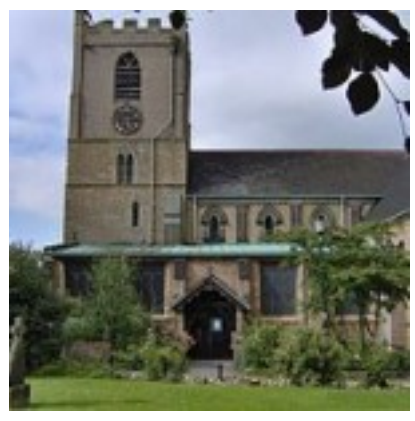
Admission is FREE..