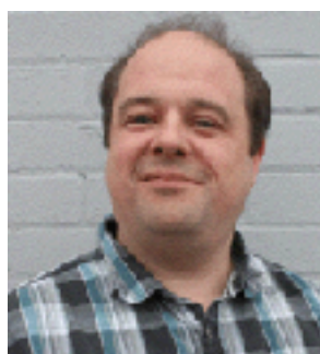
Trent and Peak Archaeology

Talks include The Rise & Fall of Colwick Locomotive Depot, Looking at Nottinghamshire Churches, Mining Memories, A Tour of Gedling, Carlton and Netherfield, Garden talks, European tours.