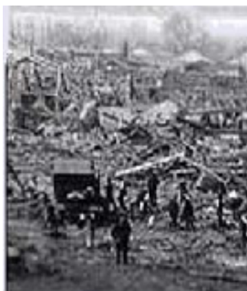
Chilwell Blast 1 July 1918