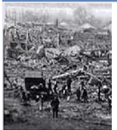
Chilwell Blast 1 July 1918