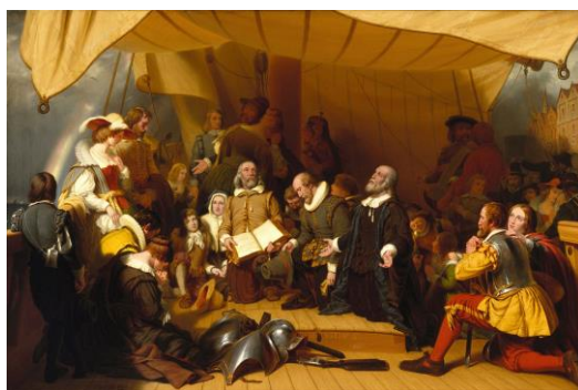
Embarkation of the Pilgrims by Robert Walter Weir. 1857