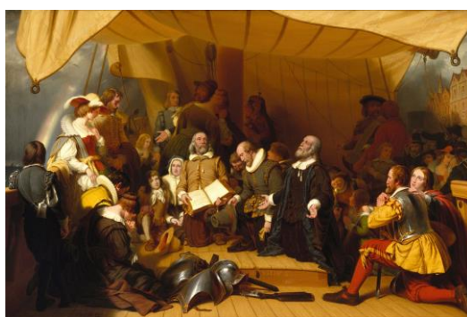
Embarkation of the Pilgrims by Robert Walter Weir. 1857