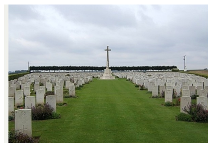
Duisans Cemetery in Etrun.

A few years ago Nottinghamshire Archives was fortunate to be offered the documents as a deposit, and with the generous help of the Heritage Lottery Fund they are now able to catalogue and preserve this unique collection of documents and photographs. Their project involves a team of young volunteers who will not only work with the records but will also learn more about the war and its affects.